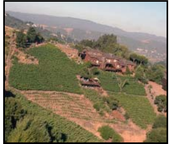
Overlooking Captain Vineyards, Moraga CA

EBMUD created the WaterSmart brand to recognize those organizations that seek and achieve outstanding water efficiency. Some businesses independently seek to become good stewards of the land and its resources. Captain Vineyards is a good example of both. The Captains started their 2.5 acre winery in May 2005 using “dry-farming” methods in order to reduce their water consumption. Traditional grape growers can use as much as 20 gallons to make a single gallon of wine. The Captains also implemented a spacing method called “5 X 3,” meaning that vine rows are 5 feet apart and plants are 3 feet apart, minimizing water use. The vineyard also uses drip irrigation and has “trained” their vines to use less water. Watering less frequently and for a longer duration trains the root system to go more deeply into the soil, thus improving the water supply capability of the root system.