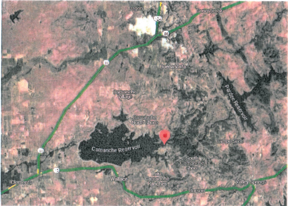
Figure 1, Vicinity Map