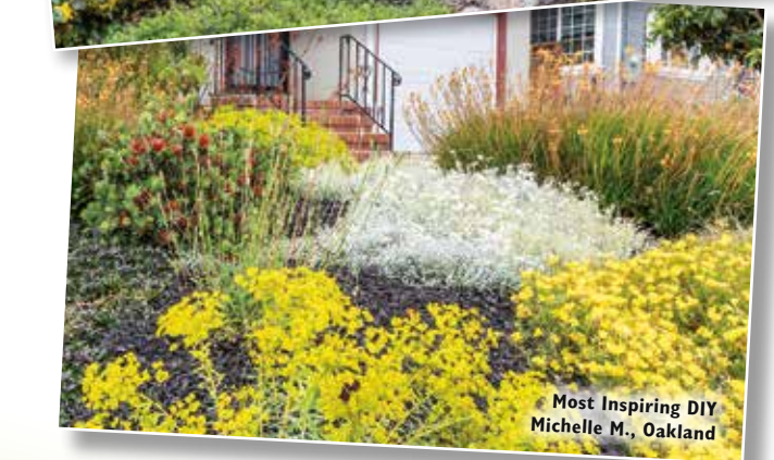
Most Inspiring DIY Michelle M., Oakland

The following outdoor watering restrictions remain in place to encourage wise water use: