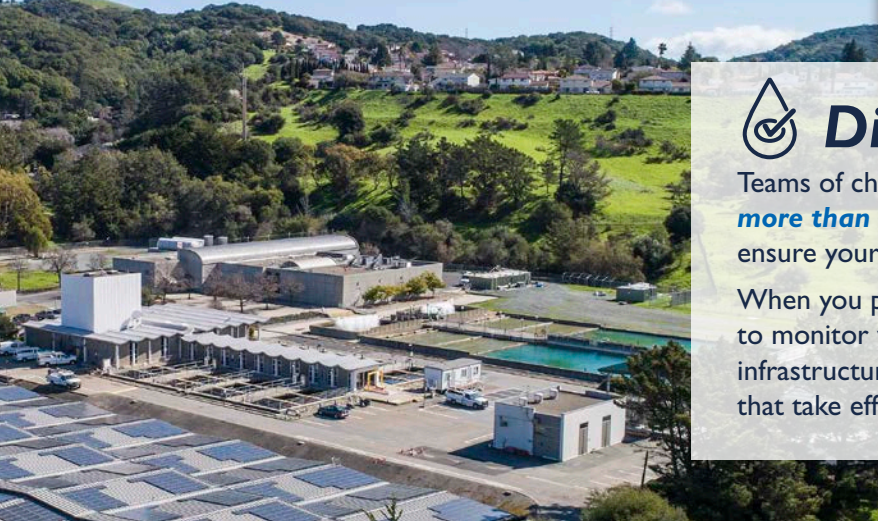
El Sobrante Water Treatment Plant

Next time you take a sip from the sink, remember—it's what's not in the water that makes it so wonderful.