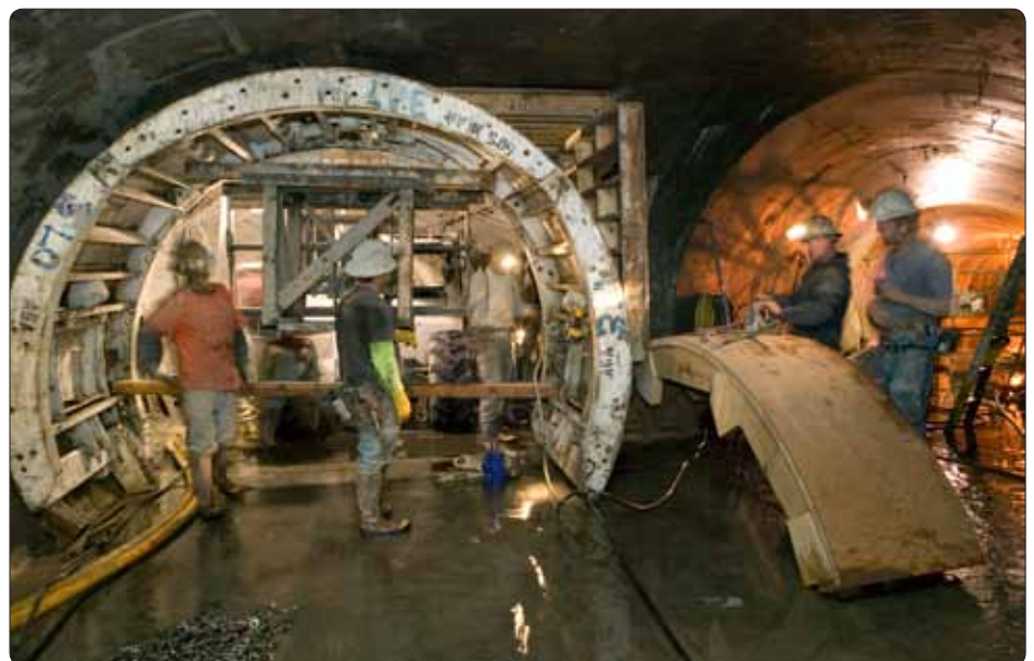
To ensure essential water delivery for 800,000 customers, EBMUD built an earthquake-ready bypass around the most vulnerable portion of the Claremont Tunnel, a massive water pipe crossing the Hayward Fault.

EBMUD's comprehensive seismic safety program is funded primarily by bonds that are being repaid through a seismic surcharge on the water bill. The surcharge is just over a dollar a month for single-family residential homes. Without these investments, the prolonged water service interruption following a major earthquake could have had a financial impact in the EBMUD service area as great as $3 billion, including business-related losses.