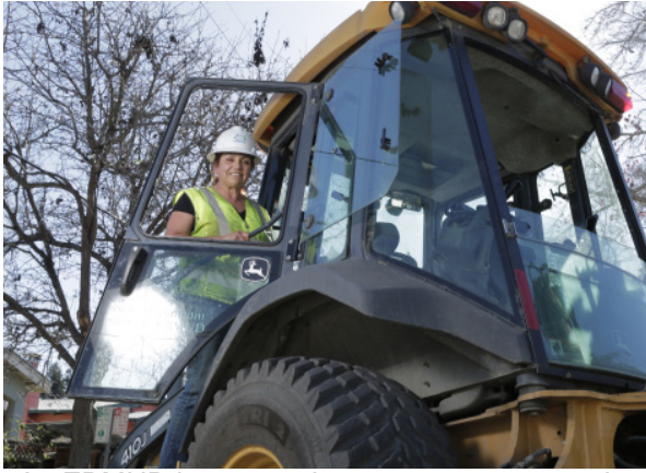
An EBMUD heavy equipment operator at work.

The Equal Employment Opportunity Commission (EEOC) released <u>Promising</u> <u>Practices for Preventing Harassment in</u> <u>the Construction Industry</u>, a document that highlights key recommendations industry leaders can take to combat harassment in construction.