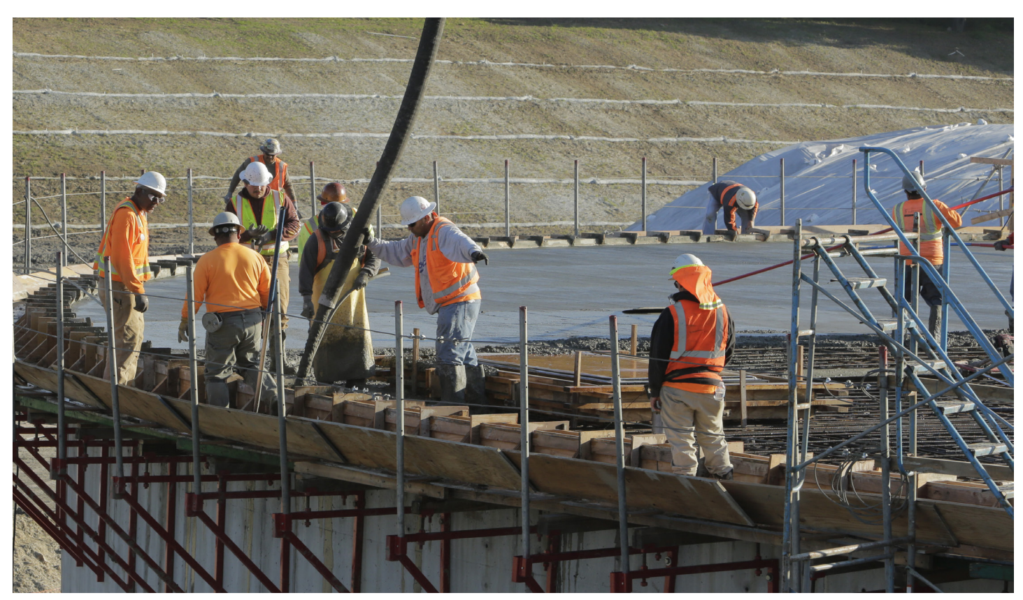
Construction workers at the Summit Reservoir on the Berkeley/Kensington border.

Article courtesy of the U.S. Equal Employment Opportunity Commission. For more information visit <u>eeoc.gov/promising-practices-preventing-harassment-construction-industry</u>