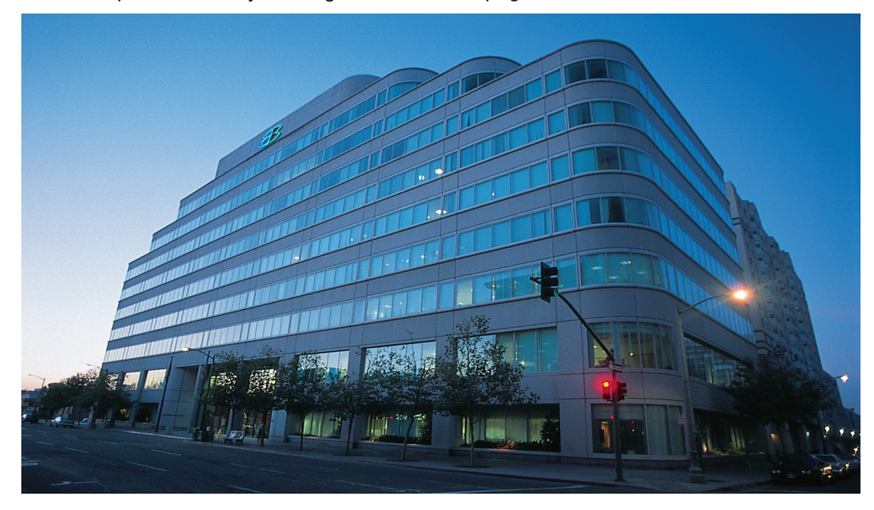
EBMUD Administration Building in downtown Oakland.

The bid documents will include supplementary bidder's qualifications and references for the contractor or subcontractor performing the demolition as well as the contractor and subcontractor performing the installation work. Updated requirements are included for this project, now being rebid after its initial 2024 bidding. For example, the roofing contractor must demonstrate experience in roofing installation on similar scale occupied multi-story buildings. In addition, the demolition sub-contractor must demonstrate experience in demolition on similar scale occupied multi-story buildings. Continues on page 3 .