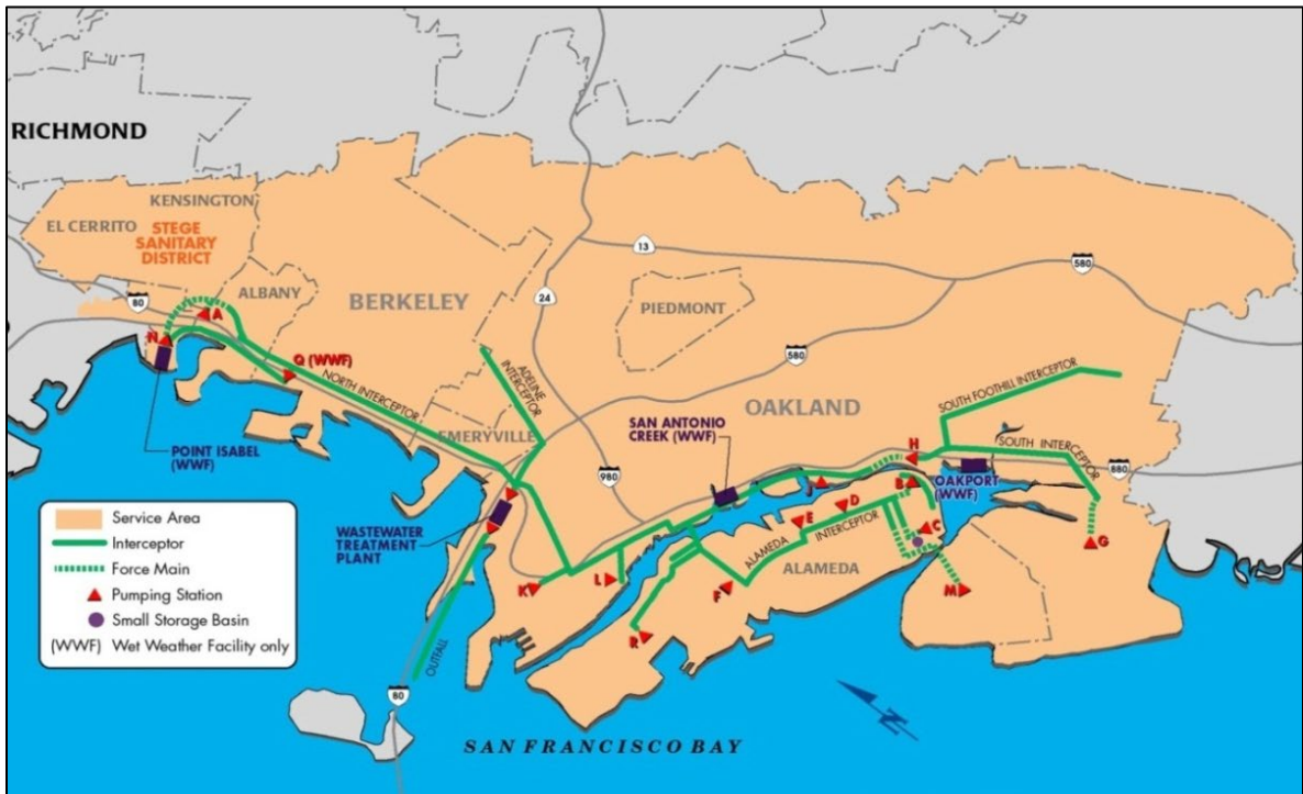
Figure 1. DISTRICT's Wastewater Service Area