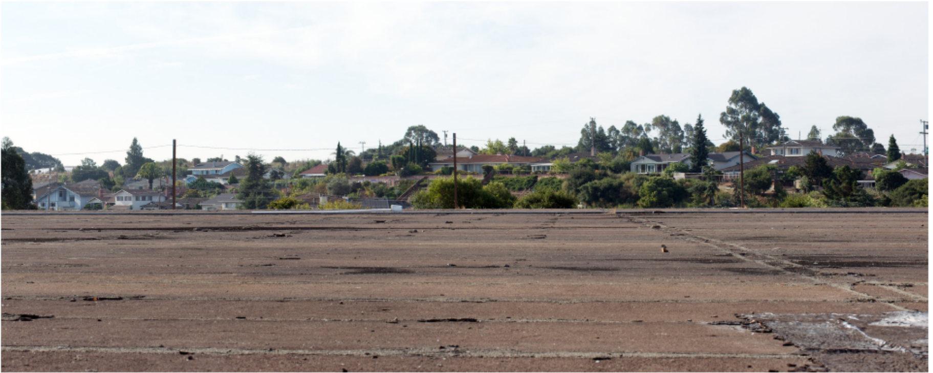
Existing view toward the south embankment, from the north side of reservoir.