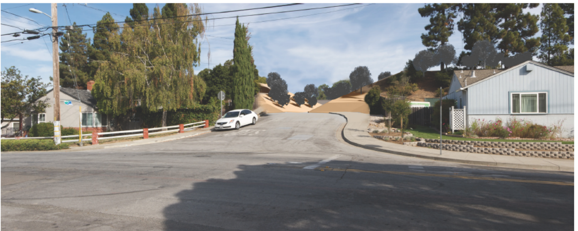
Same as above with more natural shading.