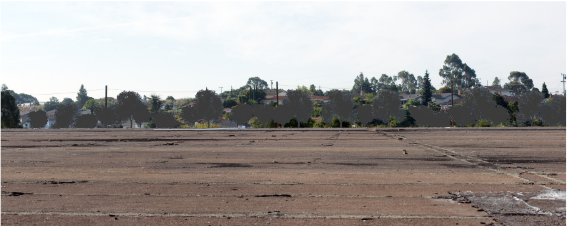
Landscaping added along the south embankment to reduce distant views.