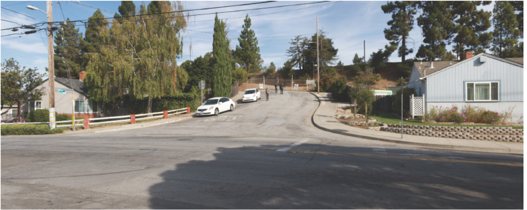
Existing view to the north, from southeast corner of Gail Dr. / Grove Wy intersection.