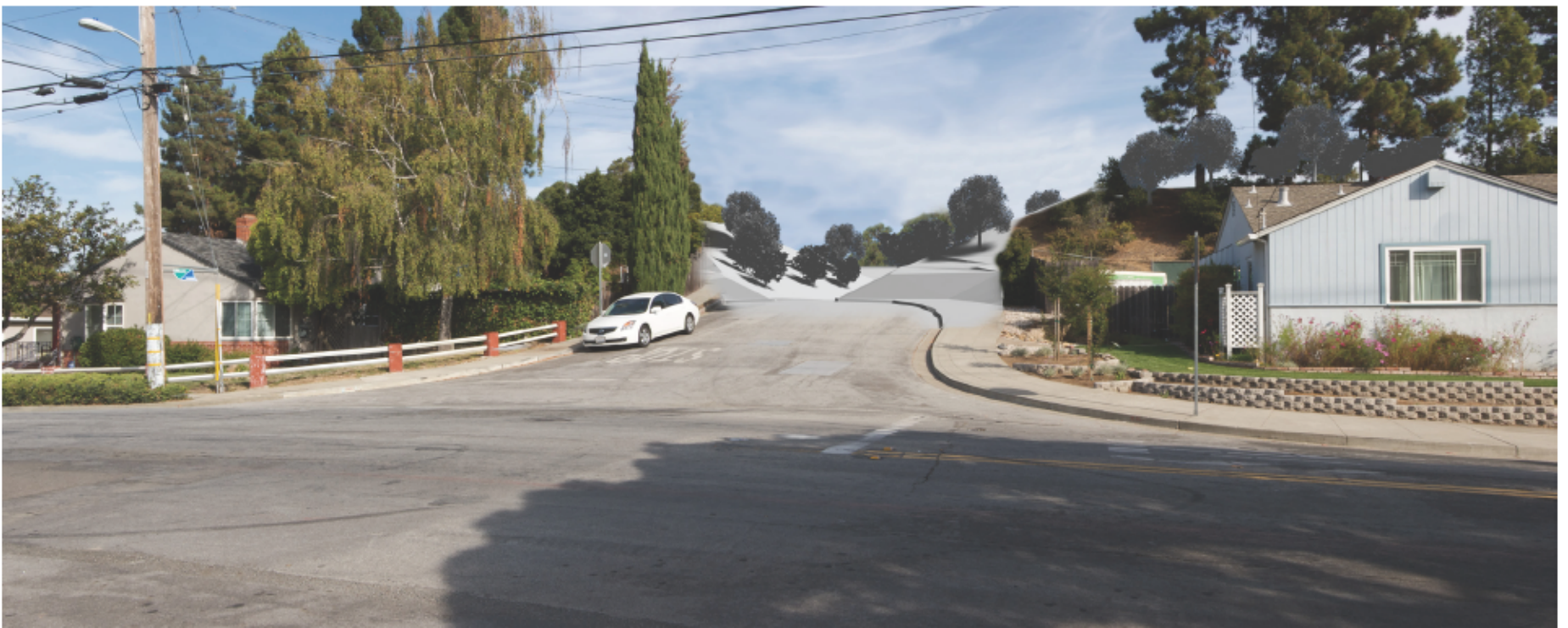
Roof removed, upper portion of Gail Dr lowered, new entry road cut in, and landscaping added. NOTE: Light post and fencing to be replaced.