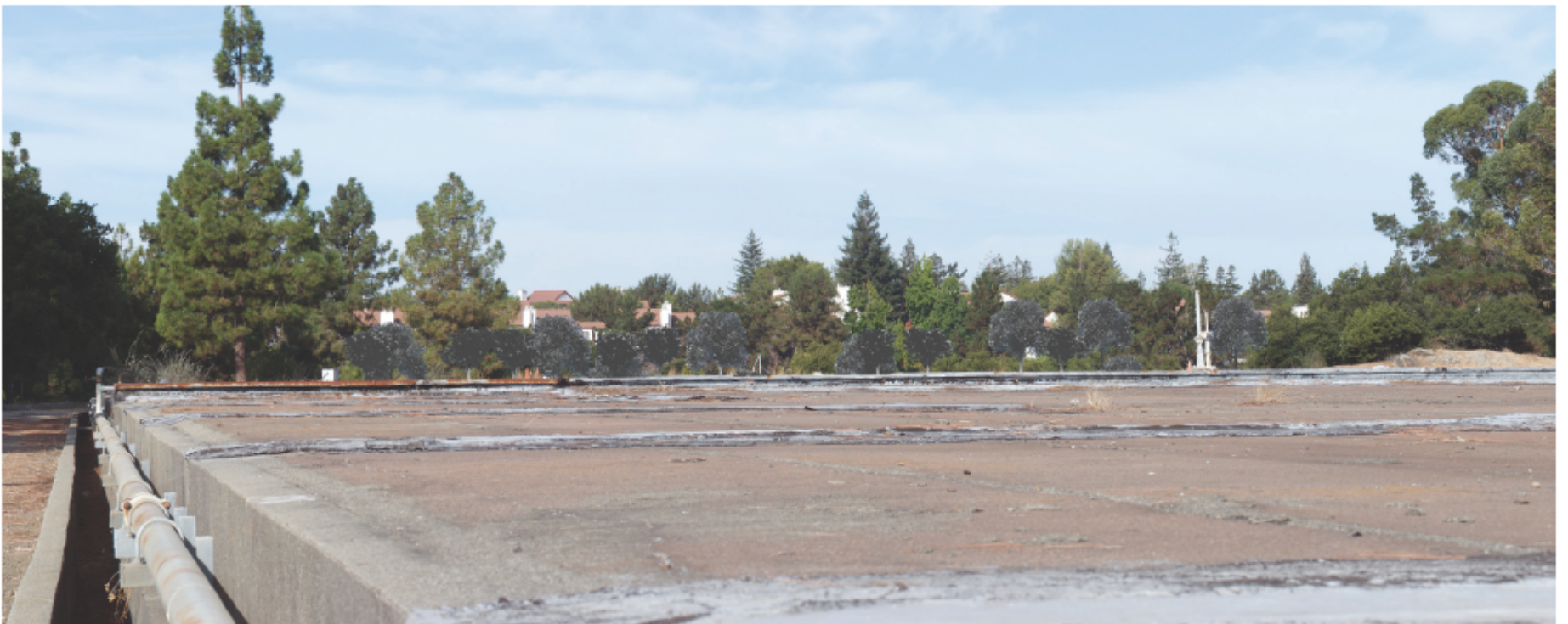
Landscaping added along west embankment to reduce distant views.