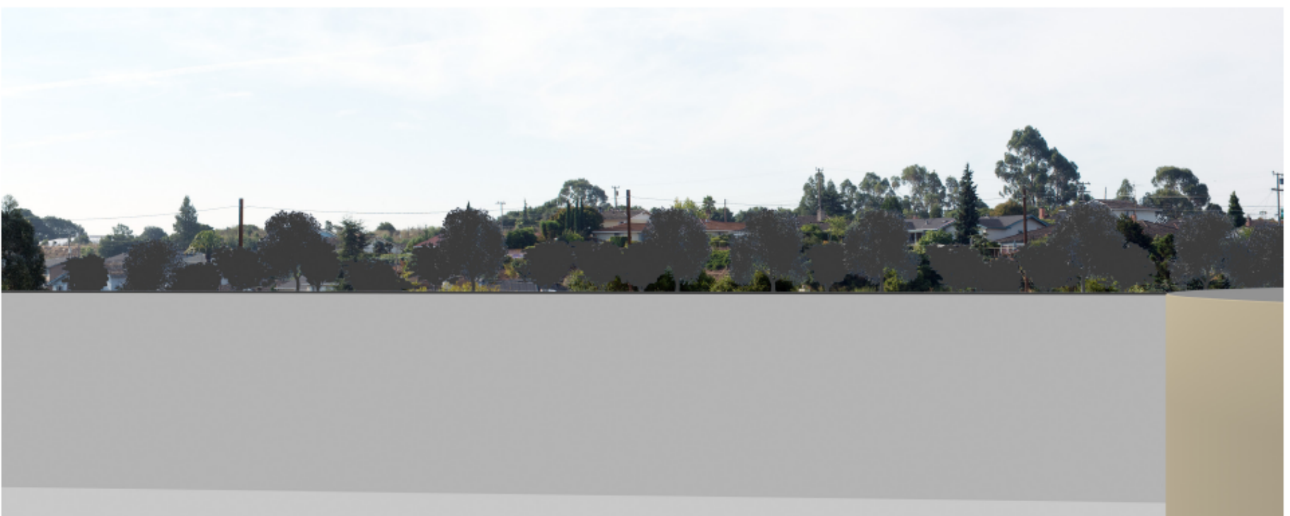
Roof removed, showing open basin and portion of new tank on the right.