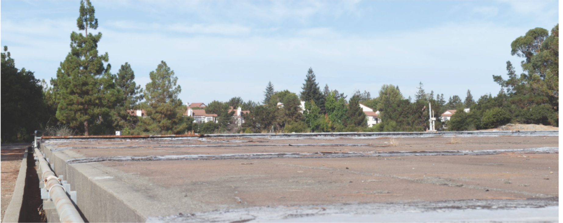
Existing view toward the west embankment, from the south side of reservoir.