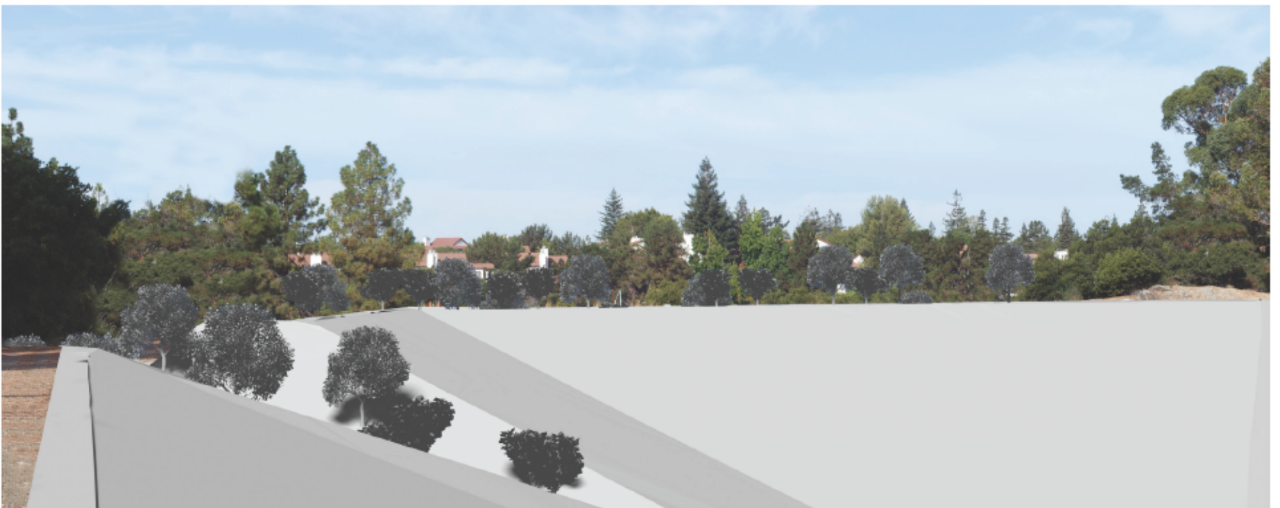
Roof removed, showing open basin with new road cut. Distant views cannot see west embankment.